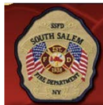
SOUTH SALEM FD