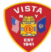
VISTA FD & EMS